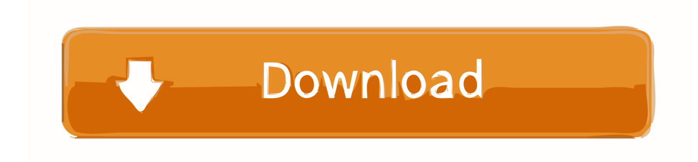
Motion Blur Texture Pack 12